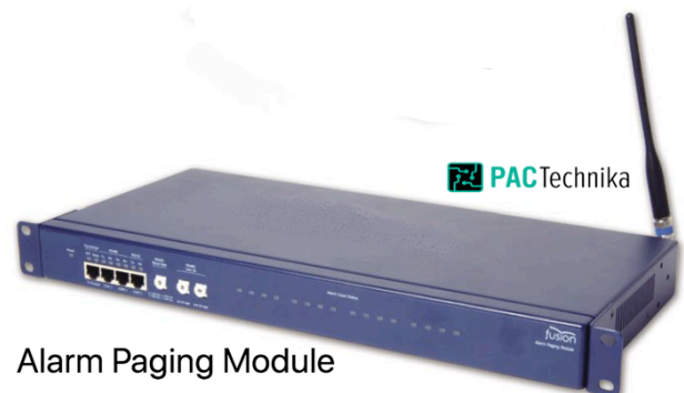
Alarm Paging Module

For more information, please contact PACTechnika.