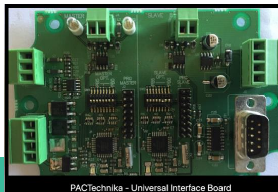
PACTechnika - Universal Interface Board